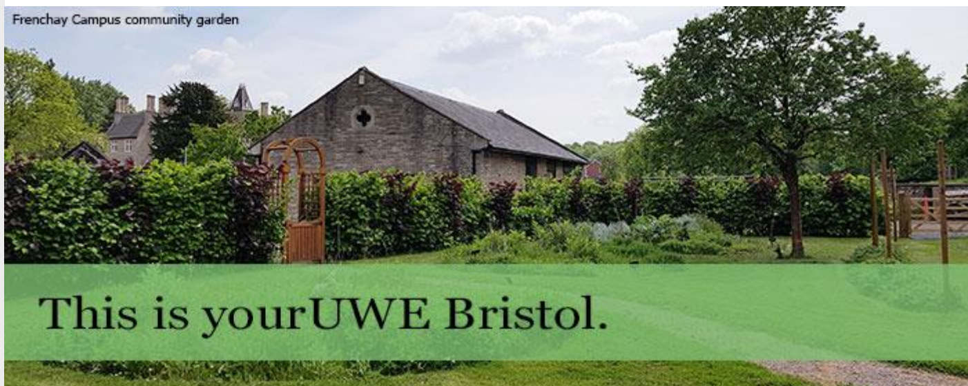
Frenchay Campus community garden