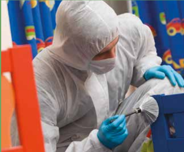
5 Crime scene house