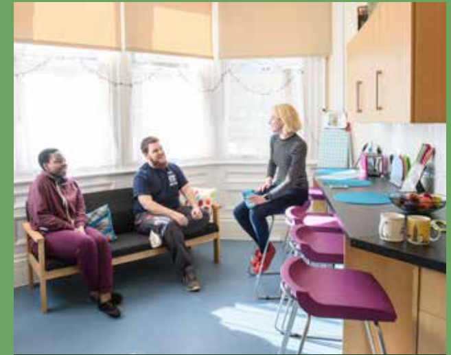
6 Student accommodation