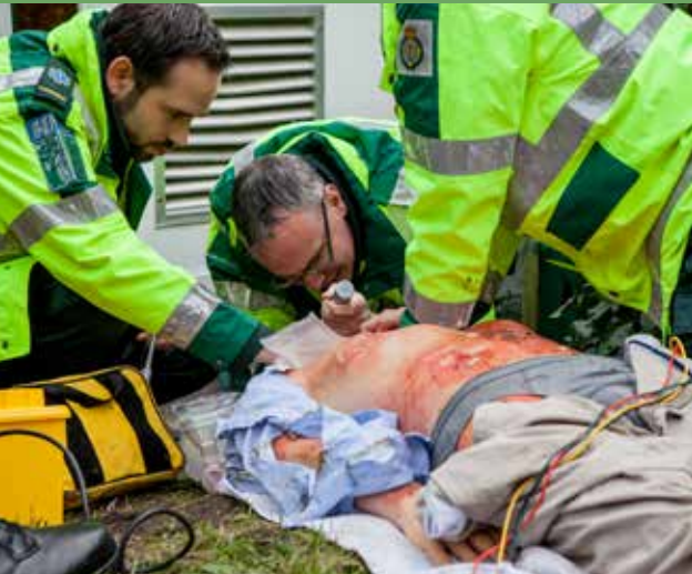
4 Paramedic response skills training