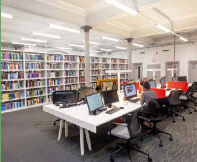
1 The Library