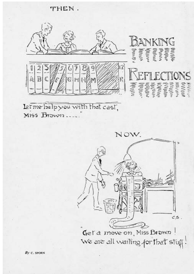
Figure 5. "Then" and "Now". C. Sporn's cartoon reflecting changing attitudes to women employees. NATPROBAN (Autumn 1938), p. 77.

collecting and analysing data on individual performance'. 50 Although some of these institutional relationships already had a long history by the outbreak of the First World War, many were relatively new, and probably the majority of these arrangements were disrupted by changes introduced in the 1920s. After 1928 mechanization was to transform many aspects of bank practice.