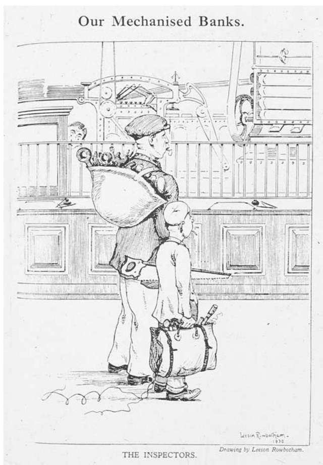
Figure 6. 'Our mechanised banks: the inspectors call', Spread Eagle (1930), p. 531.

and in the branches of the 'Big Five' was the introduction of accounting machines which allowed the posting, or data handling, of bank ledgers and customer statements, both commercial and personal. With accounting machines came standardization as their introduction transformed banking operations with the implementation of procedures designed to ensure all data handling (i.e. data collection, data presentation, data processing, data storage and data retrieval) were systematic and uniform. The specific machines preferred by an individual bank depended upon an assessment of the features supplied and the bank's requirements, but each of the 'Big Five' responded to rising costs and an increase in business, both the number of customers and transaction undertaken, by adopting this technology.