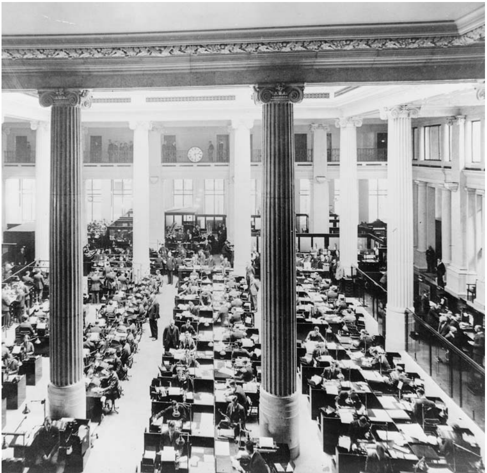
Figure 4. Machine banking in inter war Britain: the central banking hall at Lothbury after the mechanisation of the Westminster Bank's headquarter functions.

It was the branch where most customers came into contact with the bank's staff. Only the most important clients had dealings with head office which scrutinised all major loans