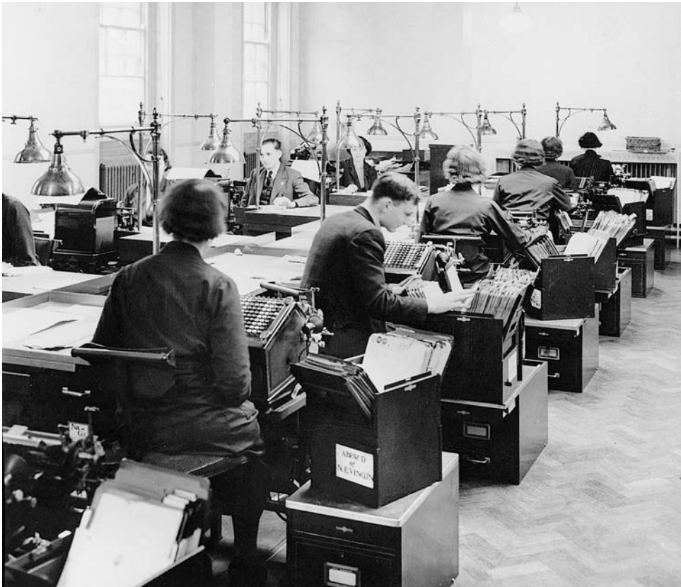
Figure 8. Mechanised banking at the Leicester Branch of the Westminster Bank, circa 1938.

labour force and the working environment. 66 Although this picture undoubtedly over-romanticises the lost gentlemanly attitude to female clerks, clearly the implications of women workers becoming extensions of a machine was evident to all bank workers. Second, issues of control and supervision of a branch bank are raised in Figure 6. Here representatives from headquarter offices, senior staff employed in the Inspection Department, appear as technicians arriving to scrutinise and fine-tune operation of a mechanical banking system at the local level. Finally, there were the customers. In addition to their own trepidations concerning change at work, bank workers were well aware of public anxiety concerning mechanisation. 67 This apprehension was not confined to aspects of security nor to the accuracy of record-keeping. In Figure 7 an attempt to defraud a branch with a forged cheque has shocking consequences – but the cartoon also carries the implication that impersonal service threatened to damage the personal relationship which so many customers valued highly. As these cartoons so clearly illustrate, recognition of the cost cutting aspects of bank mechanisation alone would represent a failure to appreciate the far-reaching impact of this managerial and technical transformation.