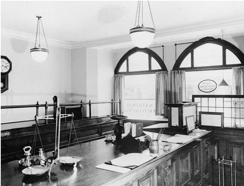
Figure 3. A traditional branch banking office – the Portishead branch of the National Provincial Bank at the beginning of the twentieth century.

Although the determination of strategy and higher managerial functions were confined to the head office of a 'Big Five' bank, functional specialization was also to be found at the branches. By 1930 an average branch probably had about seven staff but the larger branches could have circa thirty staff, including: a manager; a sub-manager; an accountant;