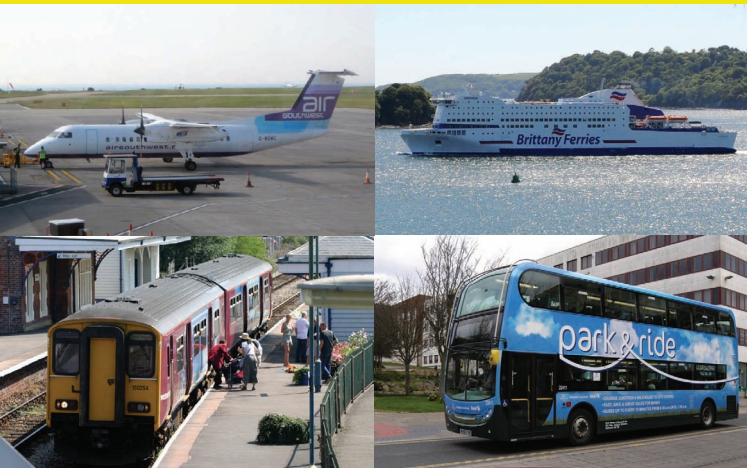
Designed by the Cartographic Resources Unit, SoGEEES, University of Plymouth